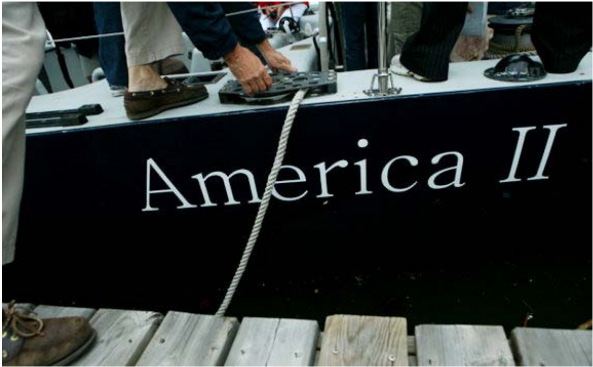
Now that its racing days are over, the America II is available for charters.