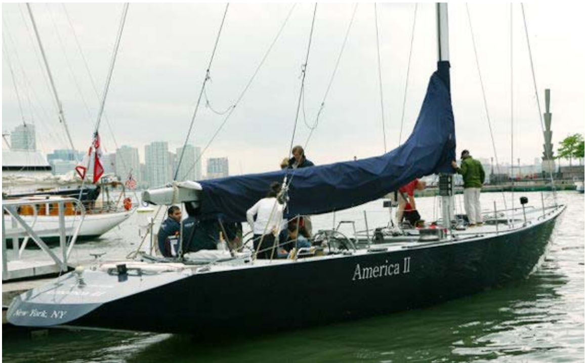
The America II rests in the North Cove marina before setting sail.