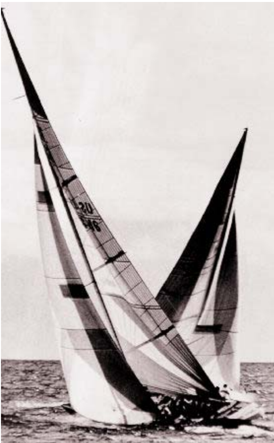
In 1986, the America II battled against New Zealand in the America's Cup foreign elimination.