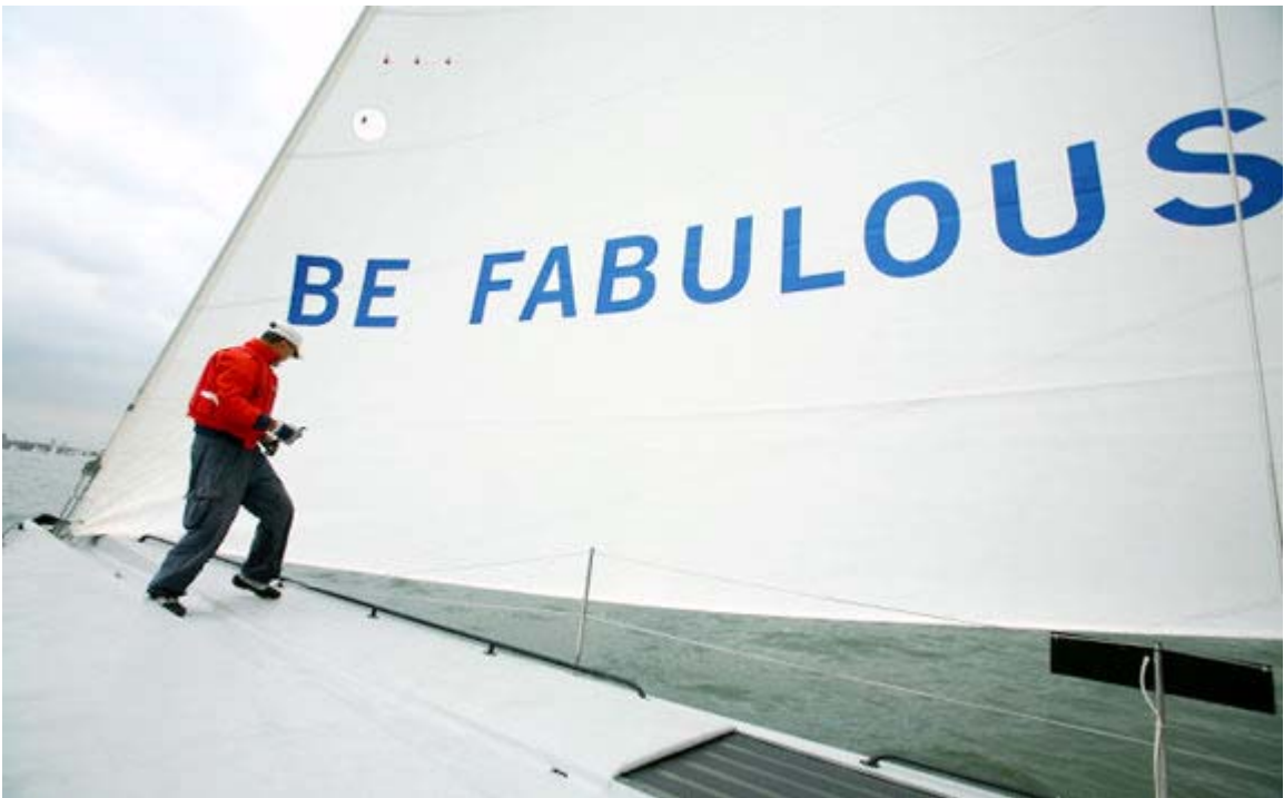
The ship's sail declares, 'Be Fabulous,' in honor of a limited-edition Moët champagne.