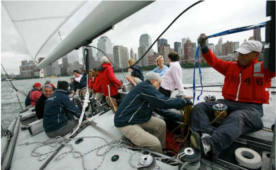
The group took a tour around the tip of Manhattan.