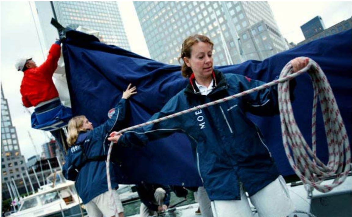
Kulla helps tie up some loose ends before calling it a night.