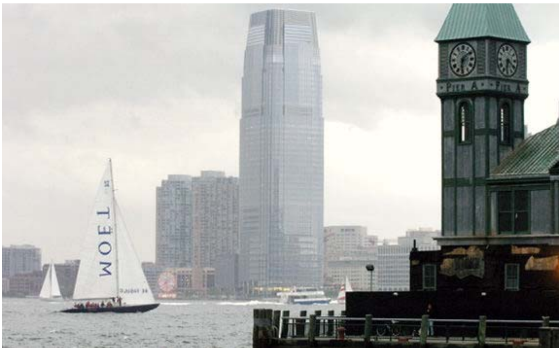
On June 13, 2007, visitors, crew, and owners went cruising on the Moet and Chandon America II, a former America's Cup contender.