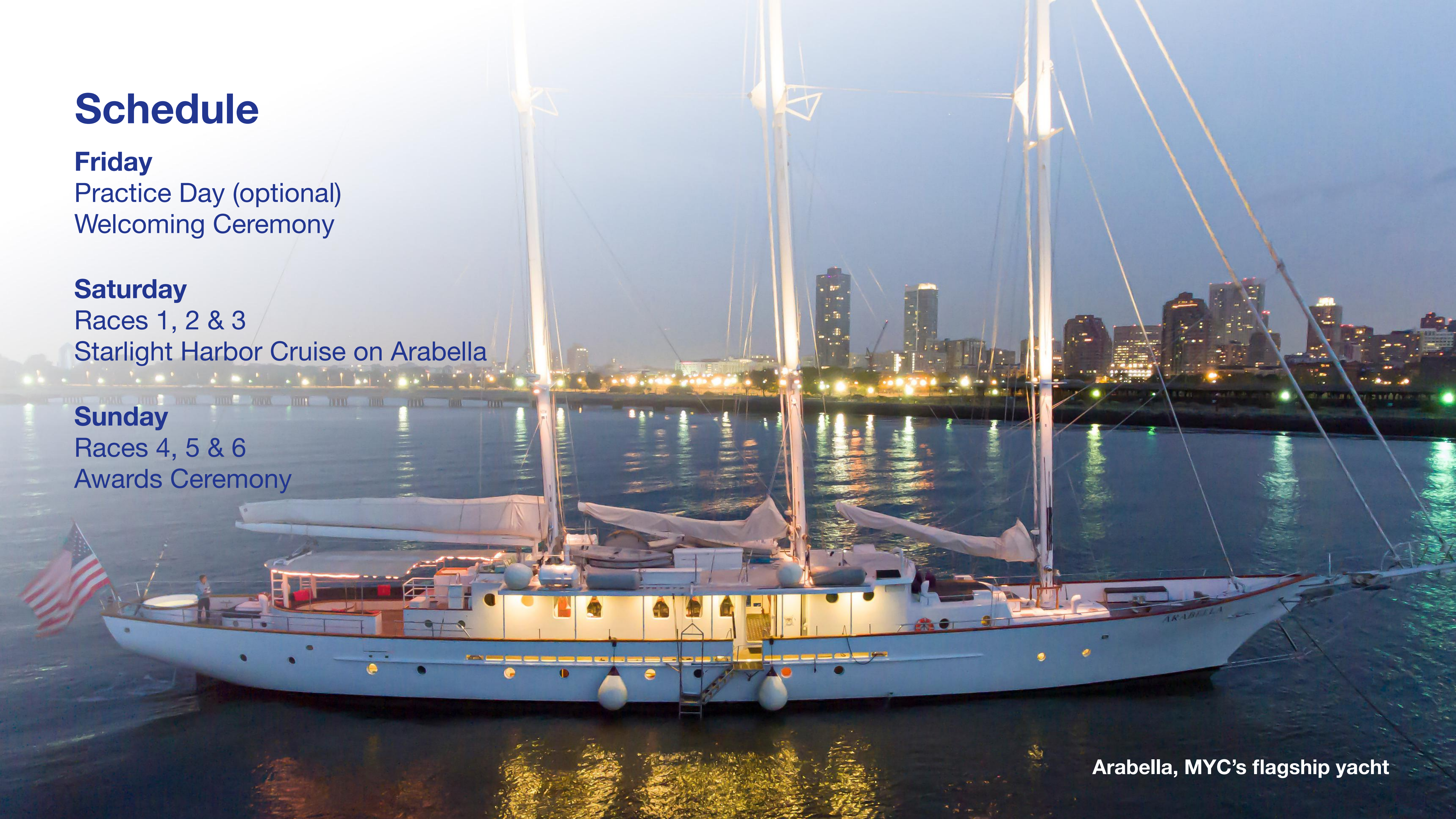
Arabella, MYC's flagship yacht